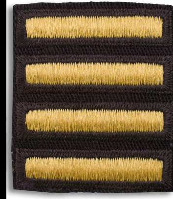
World War I & World War II