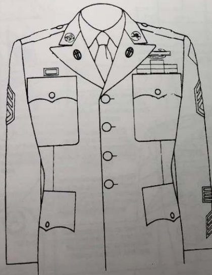
World War II Enlisted Dress Uniform